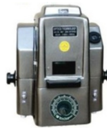
I.R Moisture Balance