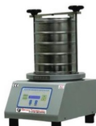
Sieve Shakers (Electromagnetic)