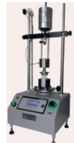
Bottle Cap Torque Tester