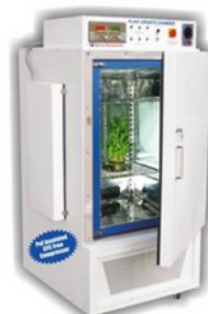
Plant Growth Chamber