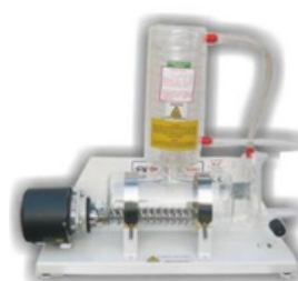
Distillation Apparatus Glass