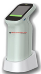
Colour Measuring Device