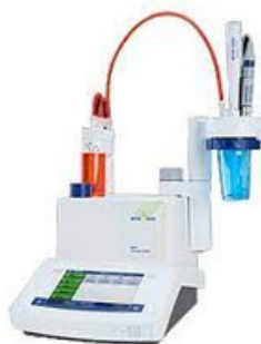
Karl Fischer Titrator