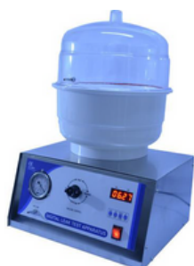
Leak Test Apparatus