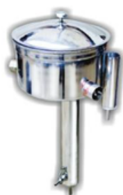
Distillation Apparatus SS