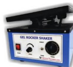
GEL Rocker Shaker