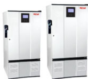
Ultra Low Deep Freezers