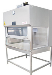
Bio Safety Cabinet