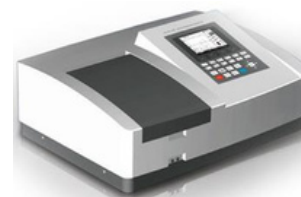
UV- VIS Spectrophotometer