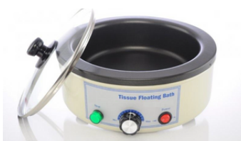
Tissue Floatation Bath