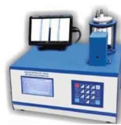
Melting Point Apparatus