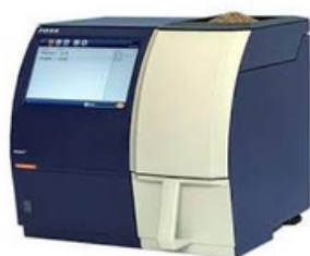
Grain Analyser NIR Analyser