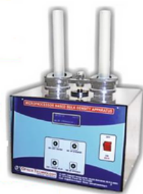
Bulk Density Apparatus