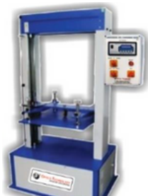
Box Compression Tester