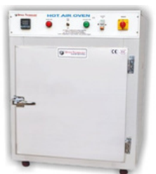
Hot Air Oven