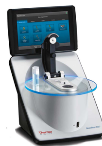
Nano Drop Spectrophotometer