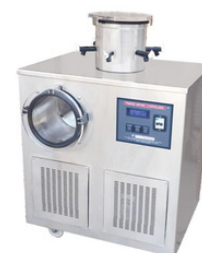
Freeze Drier (Lypholizer)