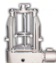
Sieve Shakers (Gyratory/Rotap/Vibratory)