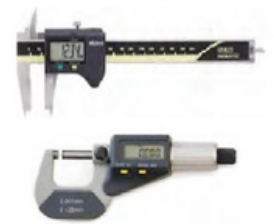
Vernier Caliper & Screw Gauge