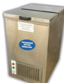
Ice Flaking Machine