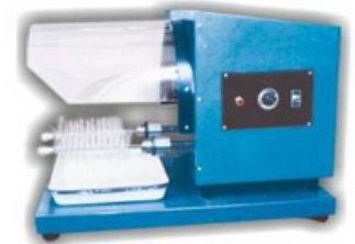
Bottle Washing Machine