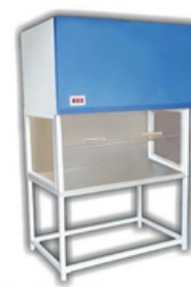
Laminar Air Flow