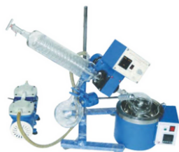
Rotary Vacuum Evaporator