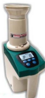
Grain Moisture Analyser