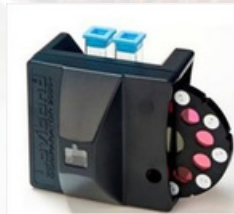
Lovibond Comparator 2000+