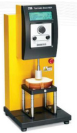
Food Texture Analyser