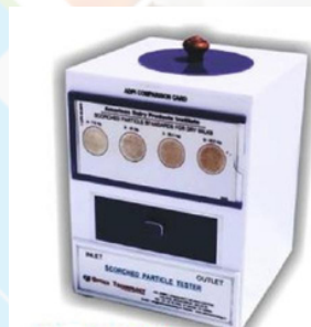
Scorched Particle Tester