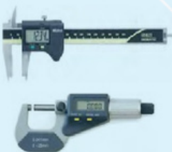
Vernier Caliper & Screw Gauge