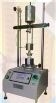
Bottle Cap Torque Tester