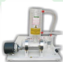
Distillation Water Unit