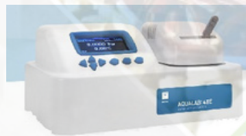
Water Activity Meter