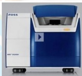
Feed Analyser NIR Based