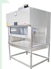
Bio Safety Cabinet