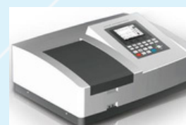
UV- VIS Spectrophotometer