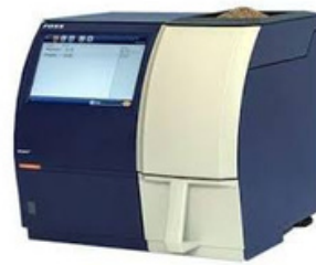
Grain Moisture Analyser