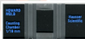
Howard Mold Chamber