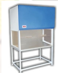
Laminar Air Flow