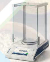
Digital Weighing Balance