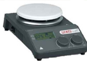
Hotplate with Magnetic Stirrer