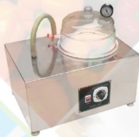
Leak Test Apparatus