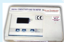
TDS & Conductivity Meter