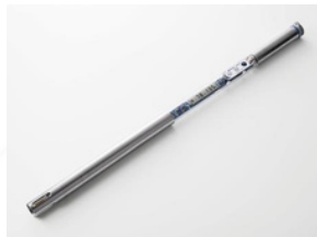
Fry Oil Meter