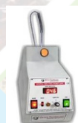
Melting Point Apparatus