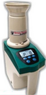
Grain Moisture Analyser