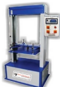
Box Compression Tester