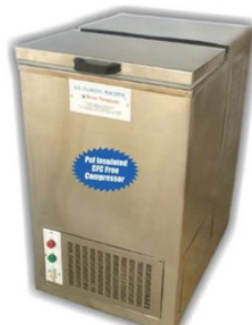
Ice Flaking Machine