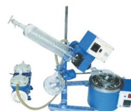
Rotary Vacuum Evaporator