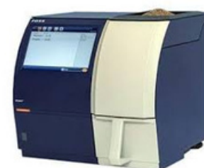
Grain Analyser NIR Analyser