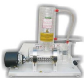
Distillation Apparatus Glass