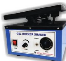
GEL Rocker Shaker