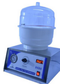
Leak Test Apparatus