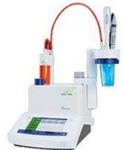
Karl Fischer Titrator