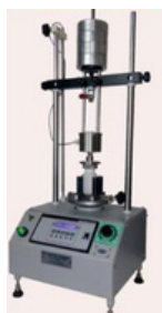
Bottle Cap Torque Tester