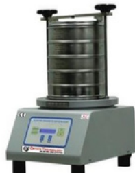
Sieve Shakers (Electromagnetic)