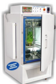
Plant Growth Chamber