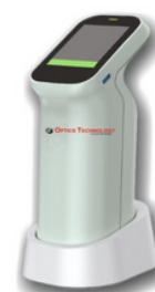
Colour Measuring Device