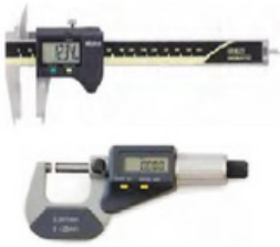
Vernier Caliper & Screw Gauge