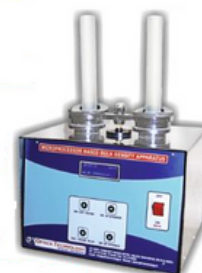
Bulk Density Apparatus