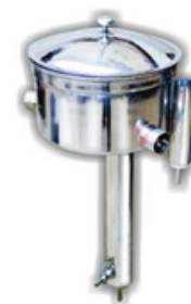
Distillation Apparatus SS