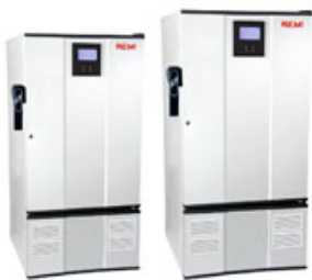
Ultra Low Deep Freezers