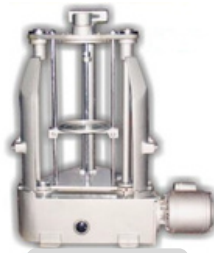
Sieve Shakers (Gyrotory/Rotap/Vibratory)