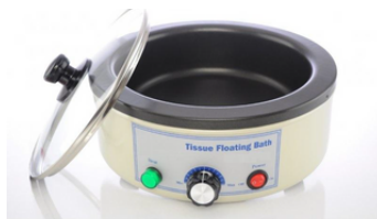
Tissue Floation Bath