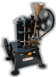
Tablet Making Machine