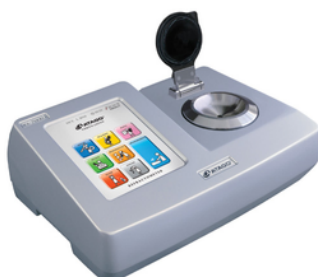
Digital Refractometer RX-i