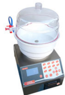
Leak Test Apparatus