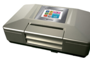
Polarimeter SAC-I Type