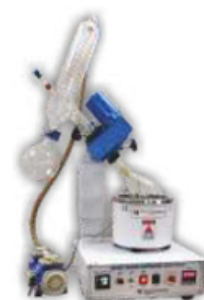
Rotary Vacuum Evaporator