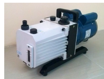
Vacuum Pump Diaphragm