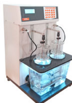
Tablet Disintegration Apparatus