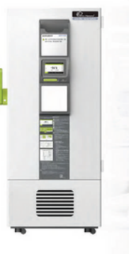
Ultra Low Deep Freezers