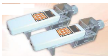
Tablet Hardness Tester Portable