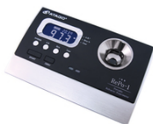
Polarimeter X Refractometer