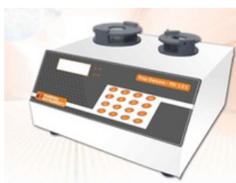
Tab Density Meter