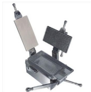
Capsule Filling Machine