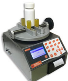
Bottle Cap Torque Tester