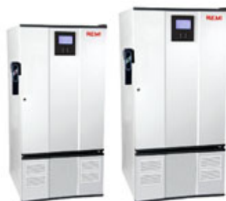
Ultra Low Deep Freezers