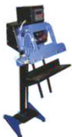
Tube Sealing Machine