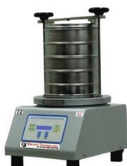
Sieve Shakers (Electromagnetic)