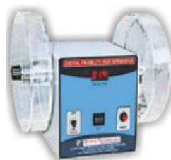
Tablet Friability Test Apparatus