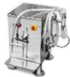
Bottle Filling Machine