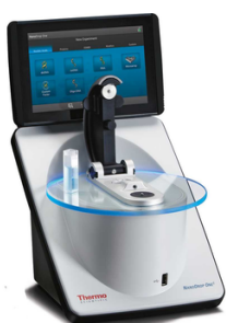
Nano Drop Spectrophotometer