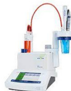
Karl Fischer Titrator