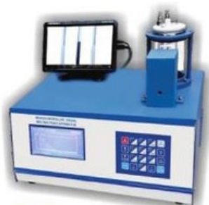
Melting Point Apparatus