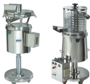
Tablet De-Burner & De-Duster