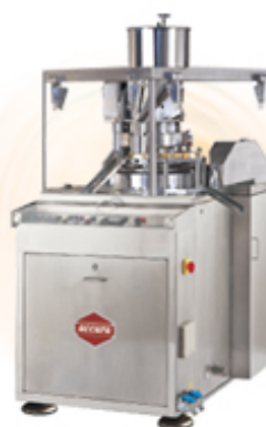
Tablet Compression Machine- 16 S