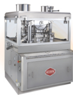
Tablet Compression Machine