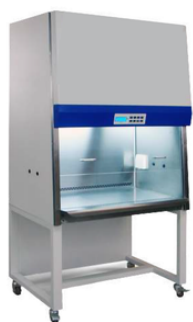
Bio Safety Cabinet