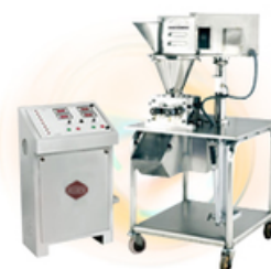
Mini Roll Compactor