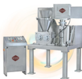
Roll Compactor cGMP