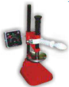
Aluminium Foil Sealer