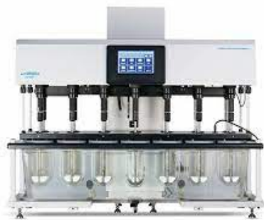
Tablet Dissolution Apparatus