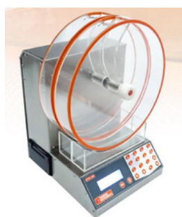
Tablet Friability Tester