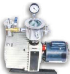
Vacuum Pump Ultra High