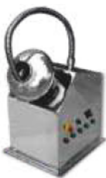
Tablet Coating Machine