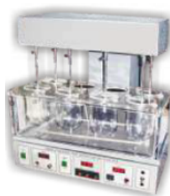
Tablet Dissolution Test