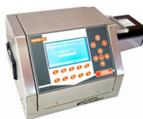
Tablet Hardness Tester